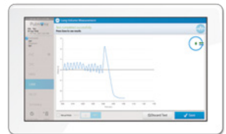
A typical lung volumes test